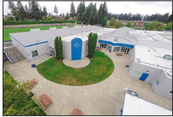
The courtyard of our Clyde Hill Jr-Sr High campus.